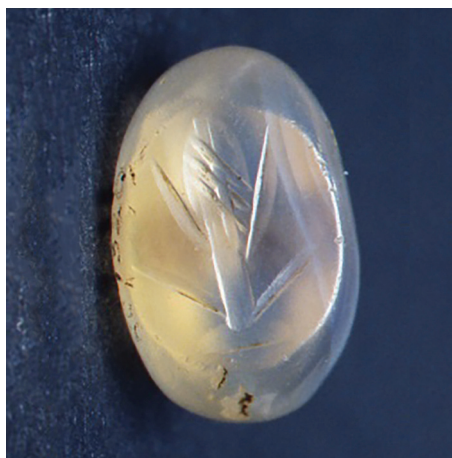
Figure 24: Tulip

Seal: 1.3cm x 1.7cm. Smokey quartz. RC 1320/1822J.