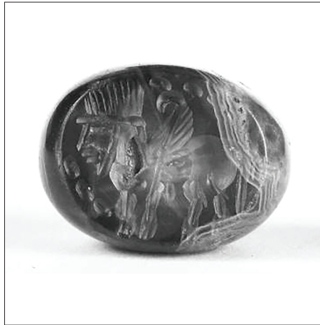
Figure 7: Lamassu

Seal: 1.6cm x 2.0cm x 1.4cm. Brown banded agate. RC 1318/1822H.