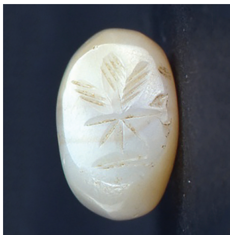
Figure 20: Date Palm

Seal: 1.8cm x 2.3cm x 1.7cm. Milky quartz. RC 1335/1822W.