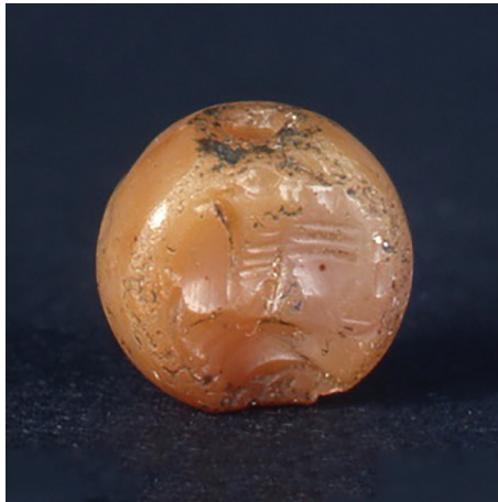
Figure 16: Eagle

Seal: 1.0cm x 1.1cm x 0.9cm Carnelian. NO RC number.