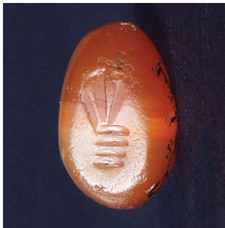
Figure 23: Pomegranate

Seal: 1.3cm x 1.6cm. Carnelian. RC 1366.