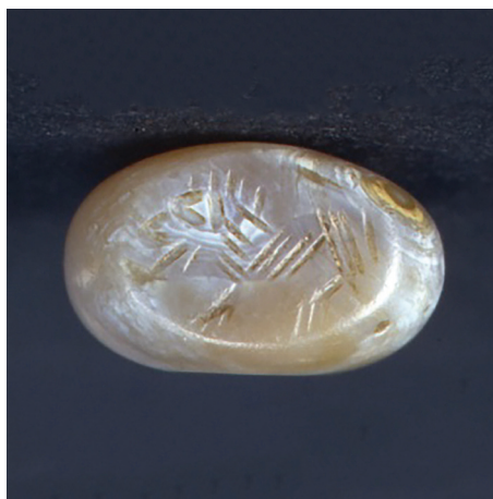
Figure 11: Lion

Seal: 1.2cm x 1.6cm x 0.9cm. White and tan banded agate. RC 1343/1823E.