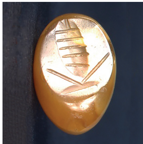
Figure 21: Pomegranate

Seal: 1.3cm x 1.7cm x 1.1cm. Carnelian. RC 1340/1823B.