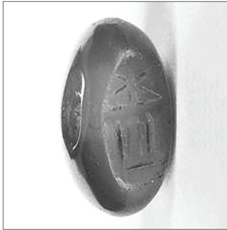
Figure 27: Altar with Star

Seal: 1.6cm x 1.8cm. Carnelian. RC 1321/1822K.