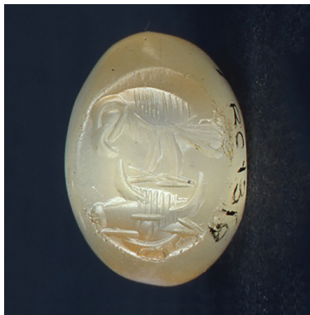
Figure 32: Bull and Bird

Period: 300–100 BCE, late Seleucid or early Parthian.