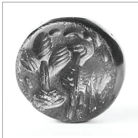
Figure 33: Ram and Palm Tree

Seal: 1cm x 1.4cm. Jasper. RC 1337/1822Y.