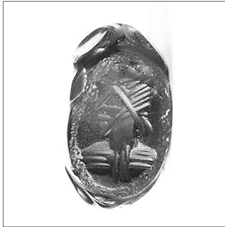
Figure 3: Male Bust

Seal: 1.5cm x 0.9cm. Jasper. No RC number.