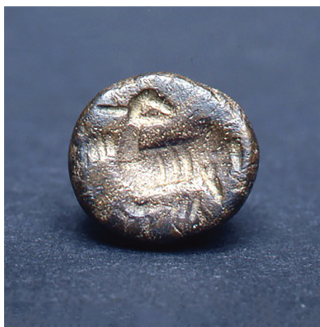
Figure 12: Lamb

Seal: 0.9cm x 1.3cm x 1.1cm. Jasper. RC 332.