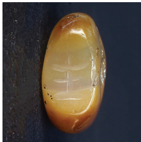
Figure 26: Cruciform Altar

Seal: 1.5cm x 1.8cm x 0.8cm. Banded agate. RC 1326/1822N.