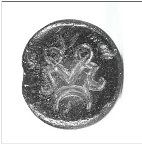
Figure 28: Monogram

Seal: 1.0cm x 1.4cm x 1.3cm. Jasper. RC 1339/1822Z.