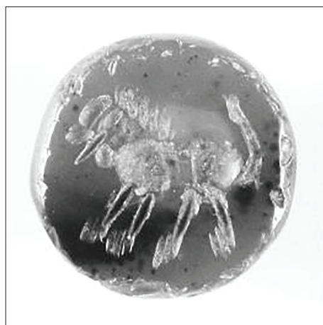
Figure 10: Griffin-like Creature

Seal: 0.8cm x 1.4cm. Carnelian. RC 1347/1823I.