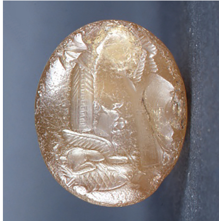
Figure 31: Griffin and Fish

Seal: 2.6cm x 2cm x 1.7cm. Chalcedony. RC 1306.