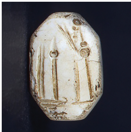
Figure 1: Man Facing Altar

Seal: 2.2cm x 1.7cm x 1.1cm. Milky quartz. RC 1308.