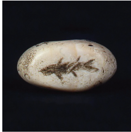
Figure 17: Fish

Seal: 1.2cm x 1.5cm x 0.8cm. Milky Quartz. RC 1363/1823X.