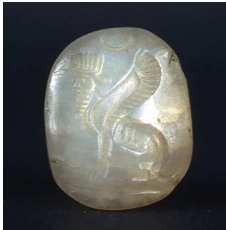
Figure 8: Sphinx

Seal: 1.6cm x 1.3cm x 1.6cm. Milky quartz. RC 1314/1822E.