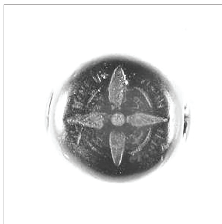
Figure 30: Cruciform