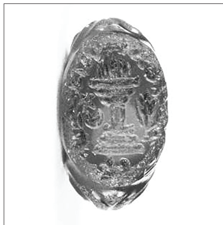
Figure 25: Fire Altar

Seal: 1.6cm x 1.9cm x 1.0cm. Jasper. RC 1321/1822K.