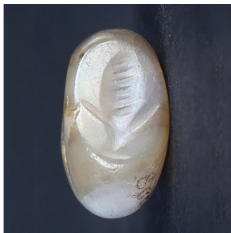
Figure 22: Pomegranate

Seal: 1.1cm x 1.6cm. Milky quartz. No RC number.