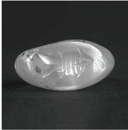
Figure 19: Fish

Seal: 1.8cm x 2.0cm. Milky quartz. RC 1824O.