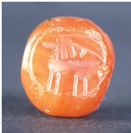
Figure 13: Antelope

Seal: 1.1cm x 1.3cm x 1.1cm. Carnelian. RC 1352/1823M.