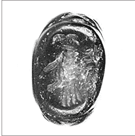
Figure 15: Bird of Prey

Seal: 1.4cm x 1.8cm x 1.1cm. Jasper. RC 1348/1823J.