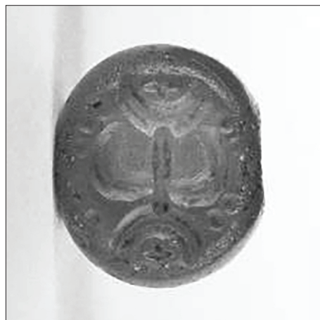
Figure 29: Monogram

Seal: 0.9cm x 1.1cm x 0.9cm. Carnelian. RC 1359/1823T.