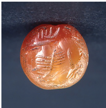
Figure 14: Stag

Seal: 0.9cm x 1.2cm x 1.1cm. Carnelian. RC 1355/1823P.