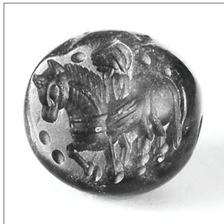
Figure 9: Winged Horse

Seal: 1.3cm x 1.6cm. Blue-green jasper. RC 1320/1822J (1822M).