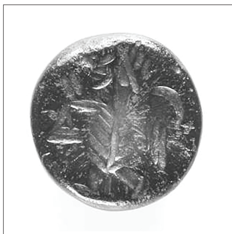
Figure 6: Winged Man

Seal: 2cm x 1.7cm. Jasper. No RC number.