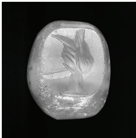
Figure 4: Hand Holding Object

Seal: 1.4cm x 1.6cm. Milky quartz. RC 1324/1822L.