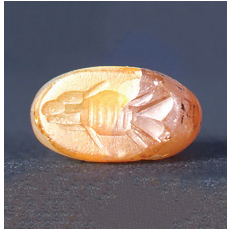
Figure 18: Fish

Period: 200–300 CE, late Parthian or early Sasanian.