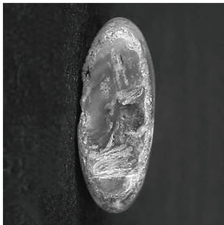
Figure 5: Hand Holding Object

Seal: 1.2cm x 1.8cm x 0.7cm. Carnelian. RC 1357/1823R.